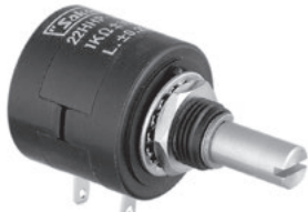
Model 22HHPM-10 (Bushingmount)