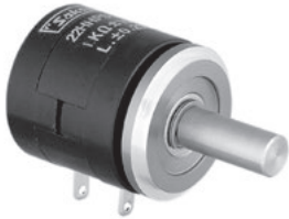
Model 22HHPS-10 (Servomount)