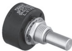
Model FCP22R (Plastic Housing)