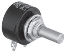
Model FCP22E (Plastic Housing)

U.S.A. PAT. No.4400687 F.R.G. PAT. No.3136765 HONGKONG PAT. No.751 of 1984 U.K. PAT. No.2087160 FRANCE PAT. No.8118538 SINGAPORE PAT. No.372/84